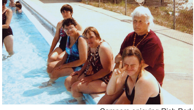
Campers enjoying Rish Park