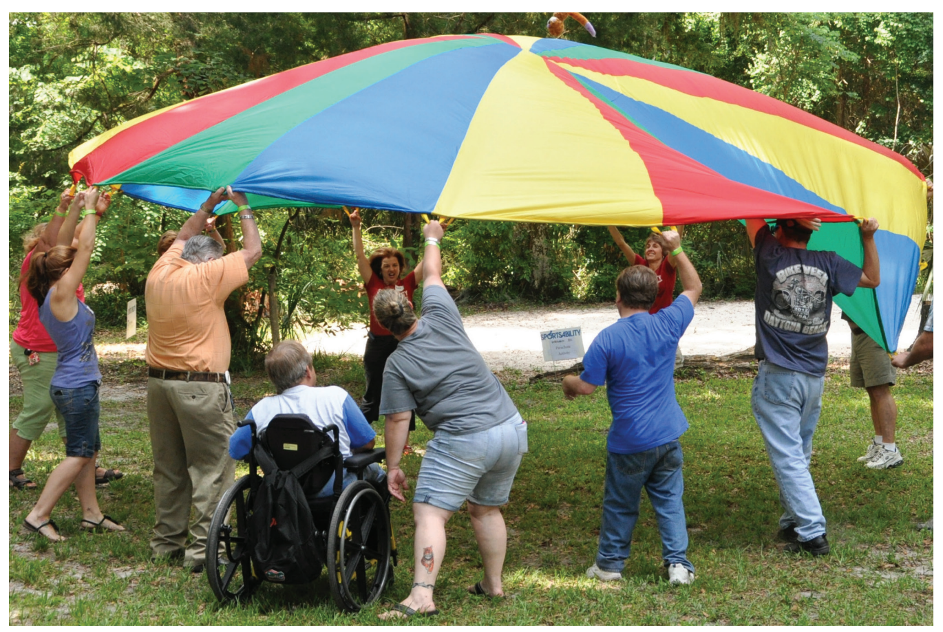
Having fun at Fanning Springs Disabily Expo

The purpose of the Disability Expo was to provide individuals in rural areas a chance to learn more about community resources and recreational opportunities.